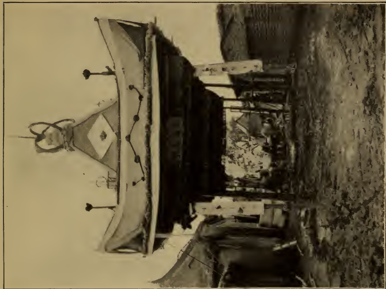
TEMPORARY FUNERAL PAVILION.